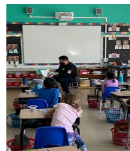
Celebrating a Love of Books during Read Across America Week

Fostering a love of reading is essential for the success of our students. Special celebrations of reading such as Read Across America Week can often make the difference in building enjoyment of reading for children. We can only hope that by helping them build this love and appreciation for reading early on, that they will continue to grow as readers throughout their lives.