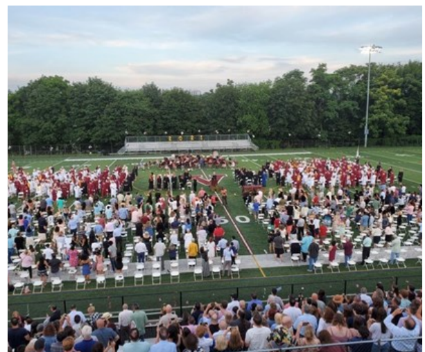
Verona High School Graduation Ceremony

These last few years have been polarizing and as educators, we hope the next chapter is about healing, about coming together to support our students, teachers, and school, and about strengthening the bonds within our community. We have much to be proud of and thankful for, the future is bright for Verona.